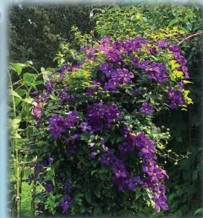
Clematis Fourth of July Collection Clematis hybrids